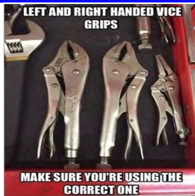
LEFT AND RIGHT HANDED VICE GRIPS