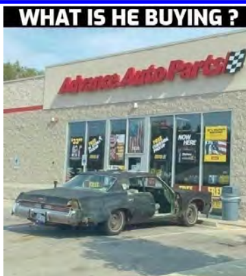
WHAT IS HE BUYING ?

“I’m starting to think that I’ll NEVER be old enough to know better” Editor’s note: “Amen to that!”